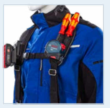
Pockets offer additional storage options for smaller tools such as screwdrivers or pens.