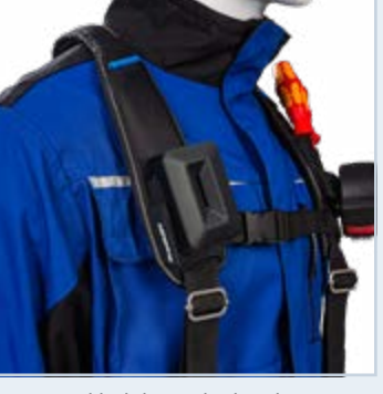
Integrated belt loops in the chest area allow optional attachment of ProClick holders. Above the shoulder strap additional ProClick bags can be added as well