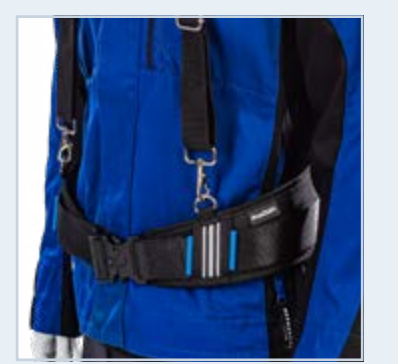
Connection to the ProClick belt with D-rings.